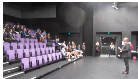
A fantastic time was had with their buddies.