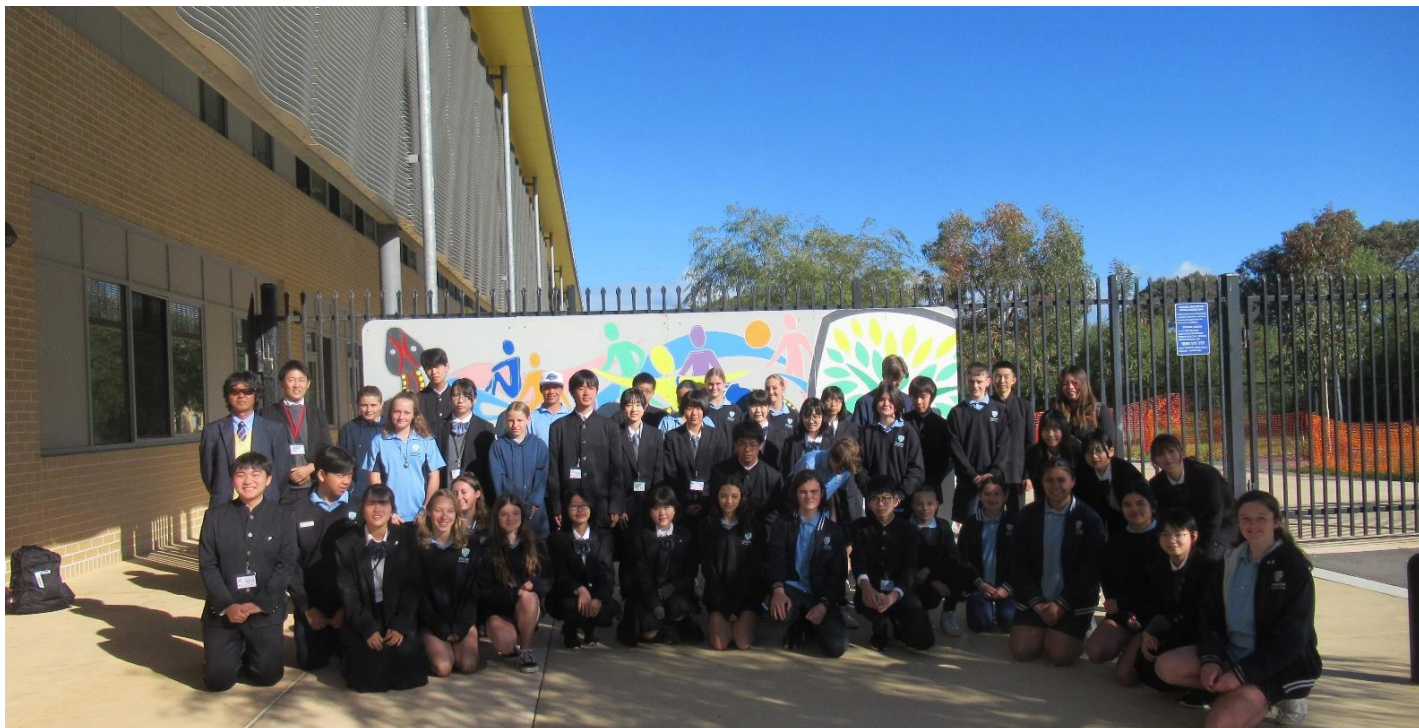
A grand welcome ceremony for our students.