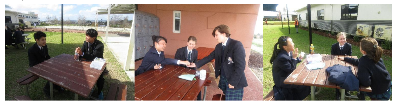
Shimodate and Swan Valley students form a buddy system due to their mutual interest in English.

We got a taste of Australian life. The students share snack at recess. You are telling a funny story.