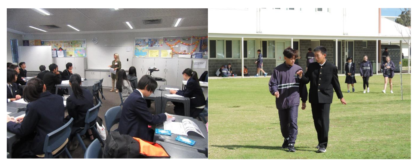
We converse about a subject.