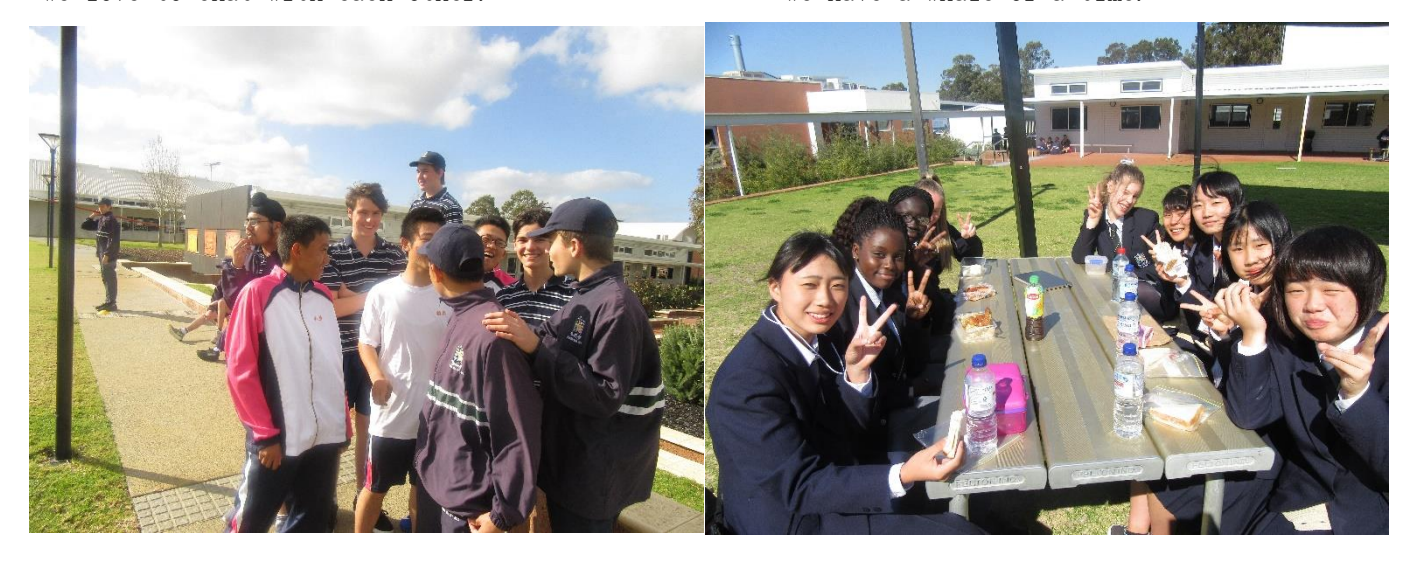
We have a whale of a time.