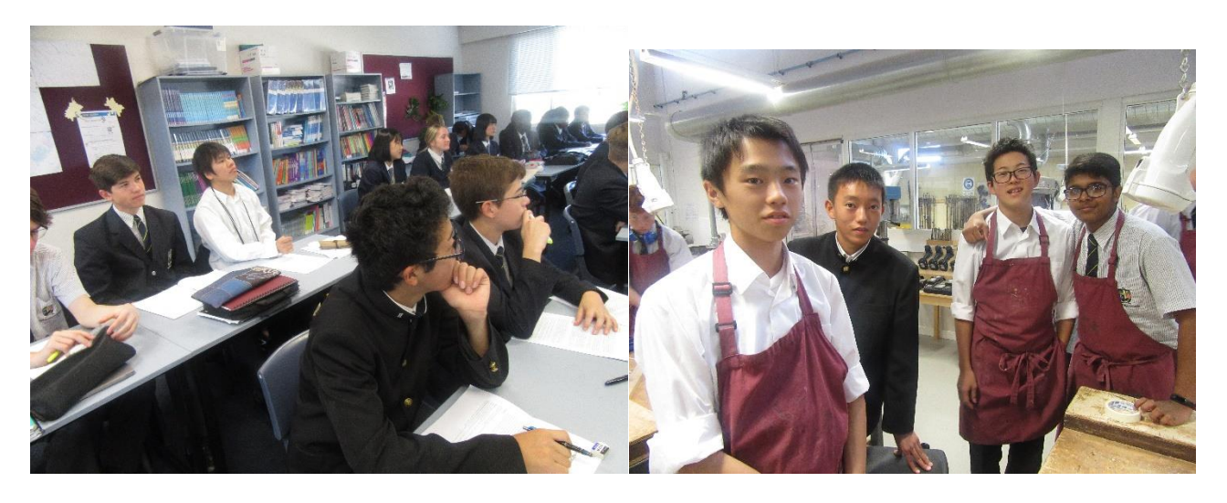
We took an ESL class.