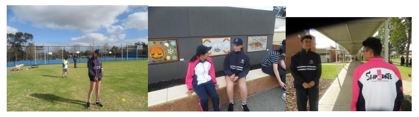
We love to chat with each other.